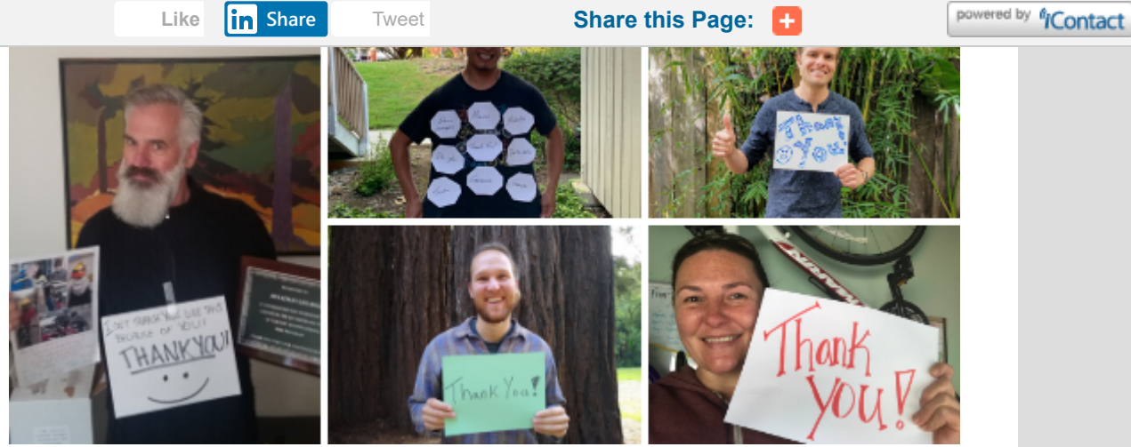
Thank you, again, for the generous donors that chose Trips For Kids Marin as part of the national #GivingTuesdayNow. If you are eager to get #morekidsonbikes, there is still time to join our spring fundraising campaign now through the end of May.